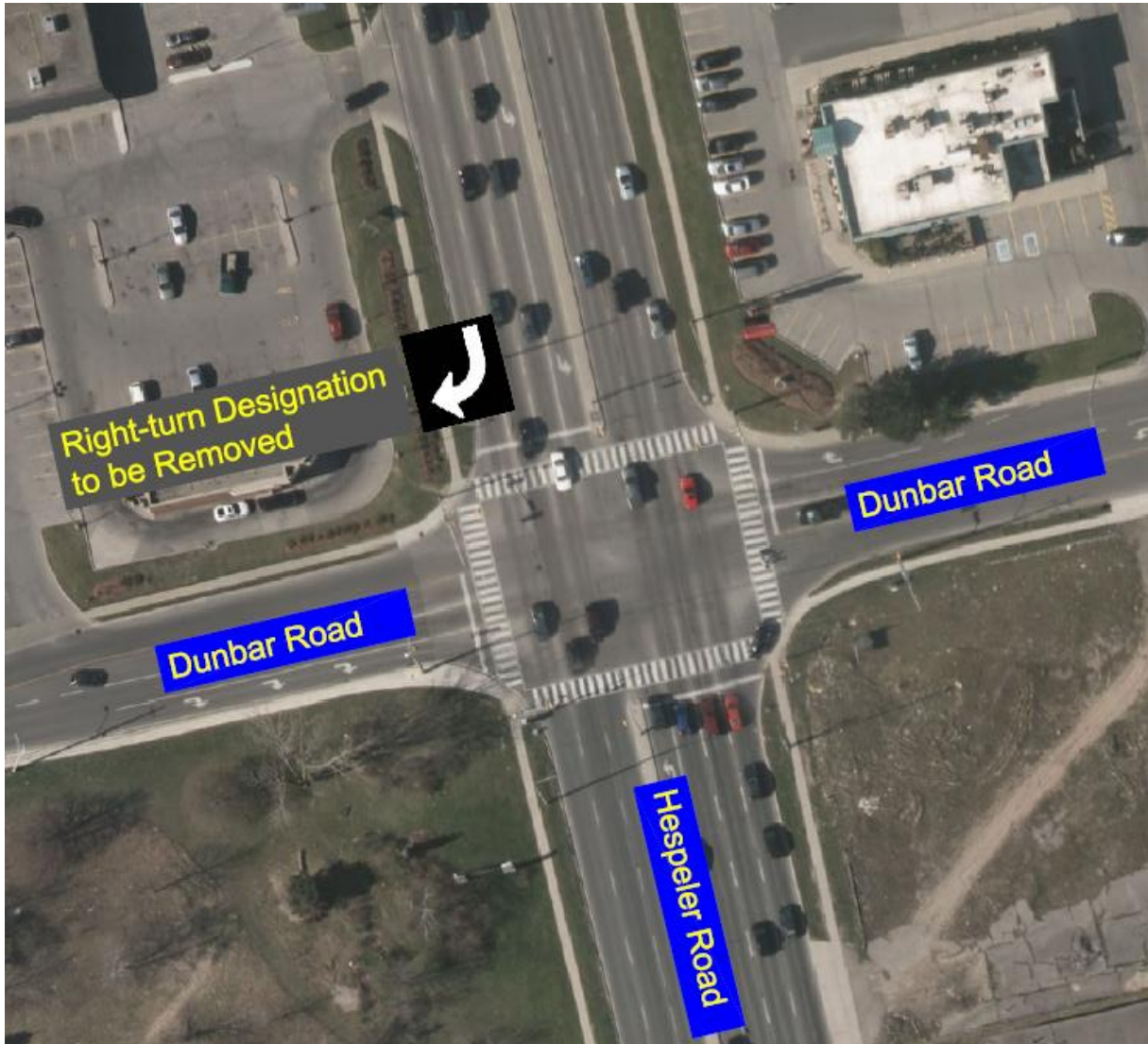
Figure 1 – Recommended Southbound Right-turn Lane Designation Removal at Hespeler Road and Dunbar Road